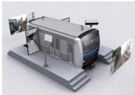
Full-scale training car with six video displays

(3) Using full-scale mockups of trains with up to six video displays fore and aft, left and right, the train operator and conductor can together perform safety checks from station arrival to departure, practice door opening and closing procedures, all in real time.