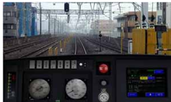
Sample image from high-definition track footage using variable-speed playback